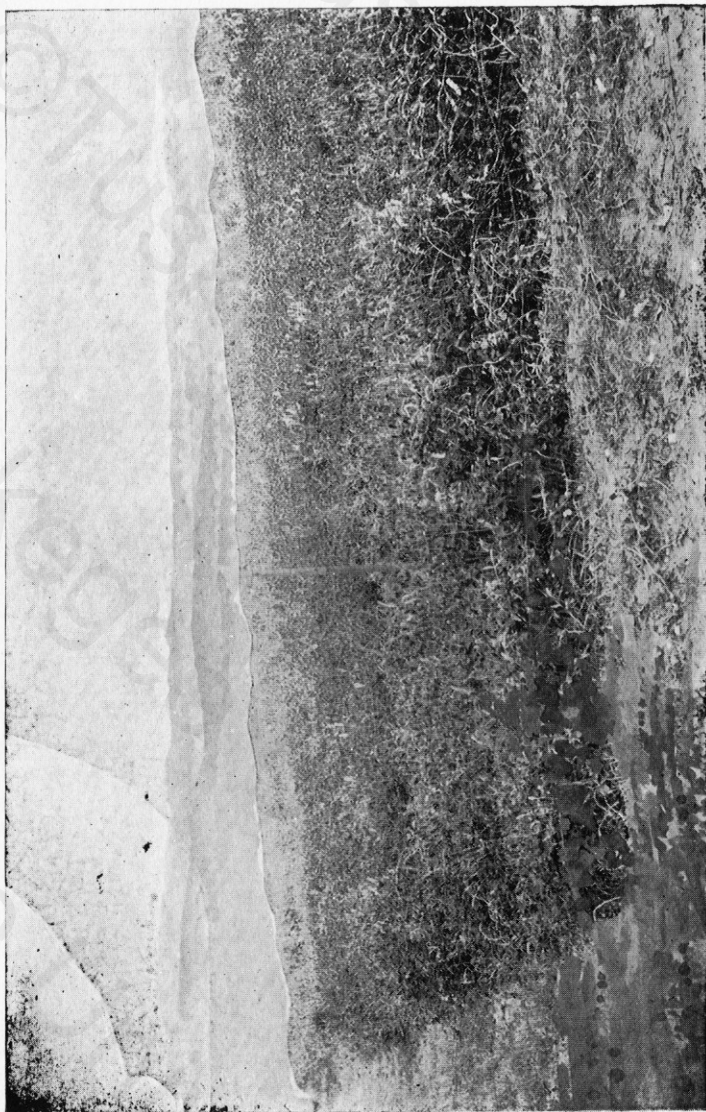
PLOT OF INOCULATED VETCH